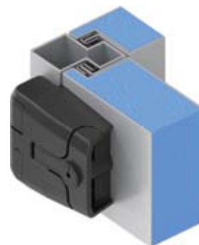
Latch with pressure relief, handle unlatched