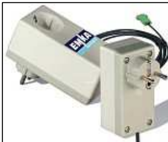
Fig. 1: 3000-U41-01