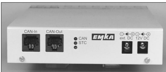
Fig. 1: 3000-U32-02 front