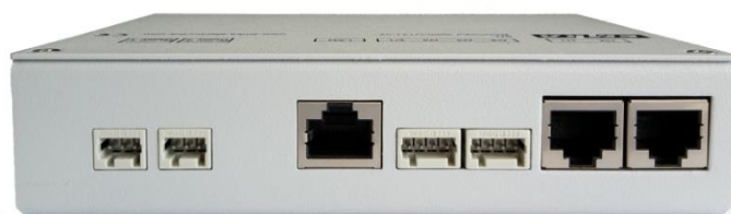
Fig. 2: 3000-U141-02 rear

The Control Unit is linked to the other units " by RJ45 patch cable. In case power is supplied to the Control Unit, connect CAN-Out to CAN-In of the next unit. Open CAN-In / CAN-Out sockets must be equipped with a terminating plug for proper operation. 2 terminating plugs are supplied with this unit.