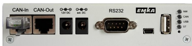
Fig. 1: 3000-U140-02 front