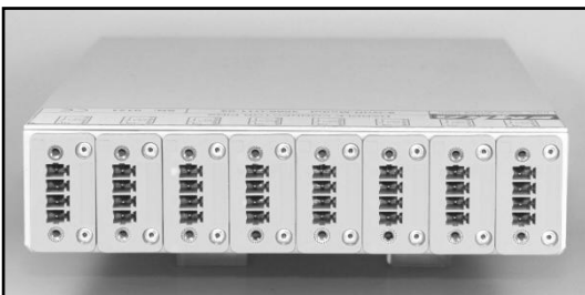
Fig. 2: 3000-U13-02 rear

A 12 VDC, 1000 mA (e.g. 3003-03-02) power supply is required for each sensor module. From this, power can be fed to other modules – keypads, communication, handle or latch modules, RFID card readers etc. by CAT 5, CAN bus patch cables. Check that the total current requirements do not exceed the rating of the power supply.