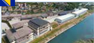
Goražde (Plant 2), Bosnia-Herzegovina