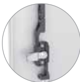
Rod control with cam