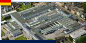
Company headquarters Velbert, Germany