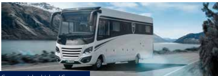
Commercial vehicles / Caravans