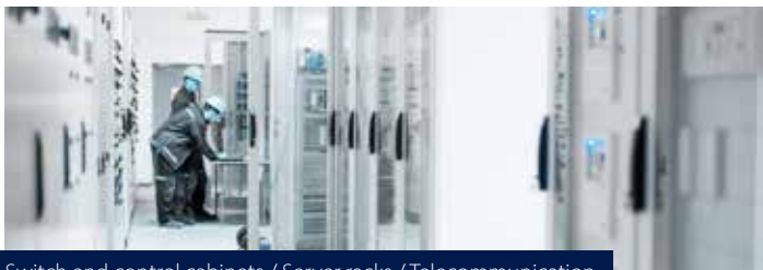
Switch and control cabinets / Server racks / Telecommunication

With its high level of in-house production, EMKA is in control of the entire production flow in every unit – from the concept to the finished product.