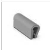
Sealing Profiles and Edge Protection