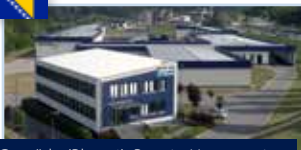
Goražde (Plant 1), Bosnia-Herzegovina