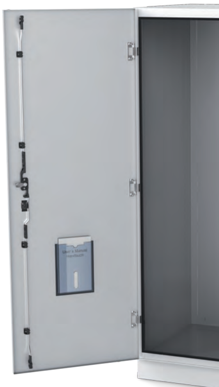
Locking rod complete with flat rod 14x3