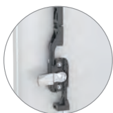
Rod control with cam