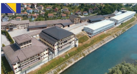
Goražde (Plant 2), Bosnia-Herzegovina