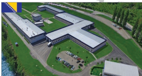
Goražde (Plant 1), Bosnia-Herzegovina