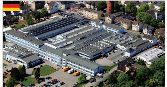
Company headquarters Velbert, Germany